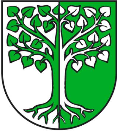
Party per pale argent and vert, a tree eradicated counterchanged