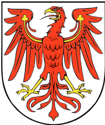
Argent, an eagle displayed gules armed and wings charged with trefoils Or