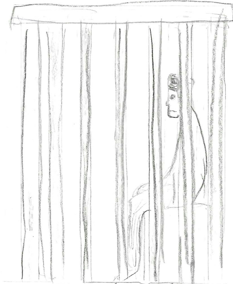
Henry VI in prison

Margaret would not give up and again and again marched into England but was always driven back by Edward. She eventually had to flee to France. Henry VI was later found and put in the tower. One thing made the nobles very angry with Edward. He had married an English woman, but the nobles had wanted him to marry a foreign princess.